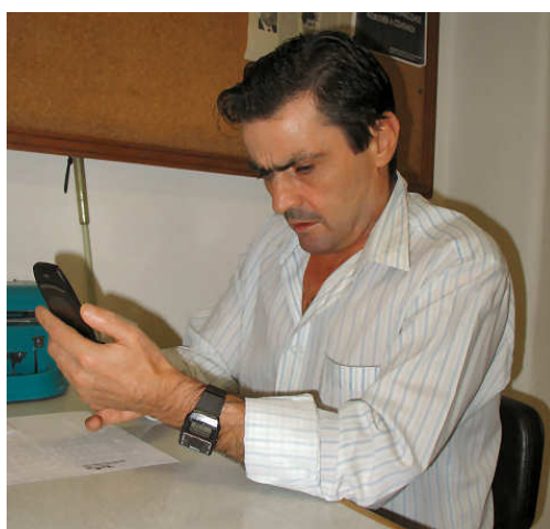
Fig. 7. Blind user testing the system

In general, all users were satisfied with the system and showed great improvements in their performance across the evaluation process (increased the number of words/minute and reduced KSPC, from the first to the final task). It is also important to notice that, although all the users had a cell phone, only one was capable of writing and sending messages. With the presented system all the users completed the tasks with success navigating through menus, writing and sending SMS and managing contacts without apparent difficulties and with good learning rates.