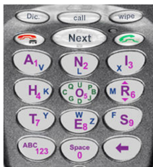
Fig. 2. MessageEase: English keyboard configuration

the user wants to enter two or more consecutive characters present in the same key with two possible solutions: key press timeout, an acceptance button.