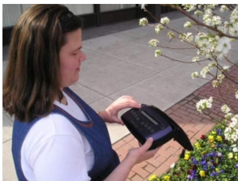
Fig. 4. Alva Mobile Phone Organizer

In a totally different scope are the screen readers, solutions that can be used in a regular mobile device, giving the users feedback on screen evolution and replacing visual feedback. Nuance Talks is an example of this type of assistive technology for the visually impaired. Although screen readers make possible for a blind user to use a mobile device, they still require for the user to memorize letter's placement. Considering performance issues, predictive systems are still very difficult to use.