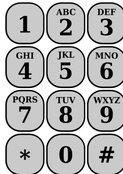
Fig. 1. Regular Mobile Phone Keypad

We present an interface that relies on alphabet navigation and dismisses memorizing, offering visually impaired individuals an easy writing mechanism. Moreover, menu navigation was also implemented and several practical tasks were evaluated with the target population.