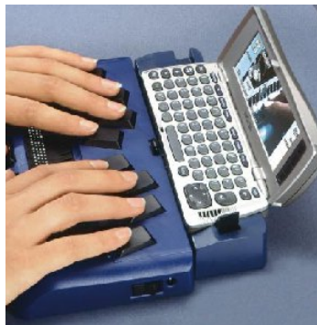
Fig. 3. Brailino

Alternative devices were developed to overcome the difficulties arising from visual impairments. Typically, these products' goal is to serve as a Personal Digital Assistant (PDA) providing functionalities like Contact Management, Calculator, Notes, Clock or SMS (sending and receiving).