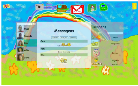
Figure 2: Message board of the application.

can be easily assigned individually to each user. The application reads all folders and files names, and uses them for the titles. In this way, the application is not bound to a main language, it uses everything that is specified by the tutor in the folder and files names. The menu icons are defined by the subfolders that exist in the base folder and in the profile folder; if for example the images folder didn't exist, then it wouldn't be available in the menu. Also, the default profile is available as default for every children, and if we add a profile to a child, specifying their name (e.g. johndoe profile), the tool gives priority to the individual profile, and only then, to default profile.