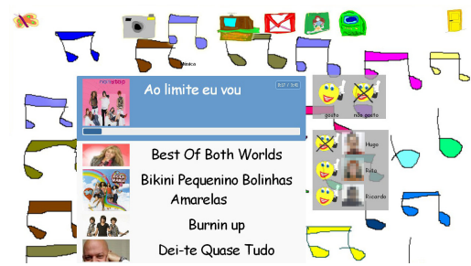
Figure 3: Activity with content preference-sharing pane.

When the receiver colleague opens the message board, he will immediately be able to see all of the messages sent to him by others. Figure 2 shows the message board screen. For content preference sharing, associated to each multimedia element (image, sound or video), there is a positive and a negative preference option. These allow the child to express and share with its counterparts at any time, his/her preference regarding the individual element. This information is associated with the content and shown every time it is accessed, allowing all children to see the opinion of their colleagues. Figure 3 shows one of the activities with the